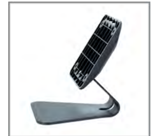
Adjustable Stand 30°/45°/60° Tilt AC-112