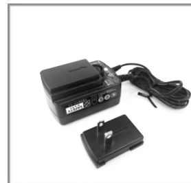
Adapter DC 12V 1.5A